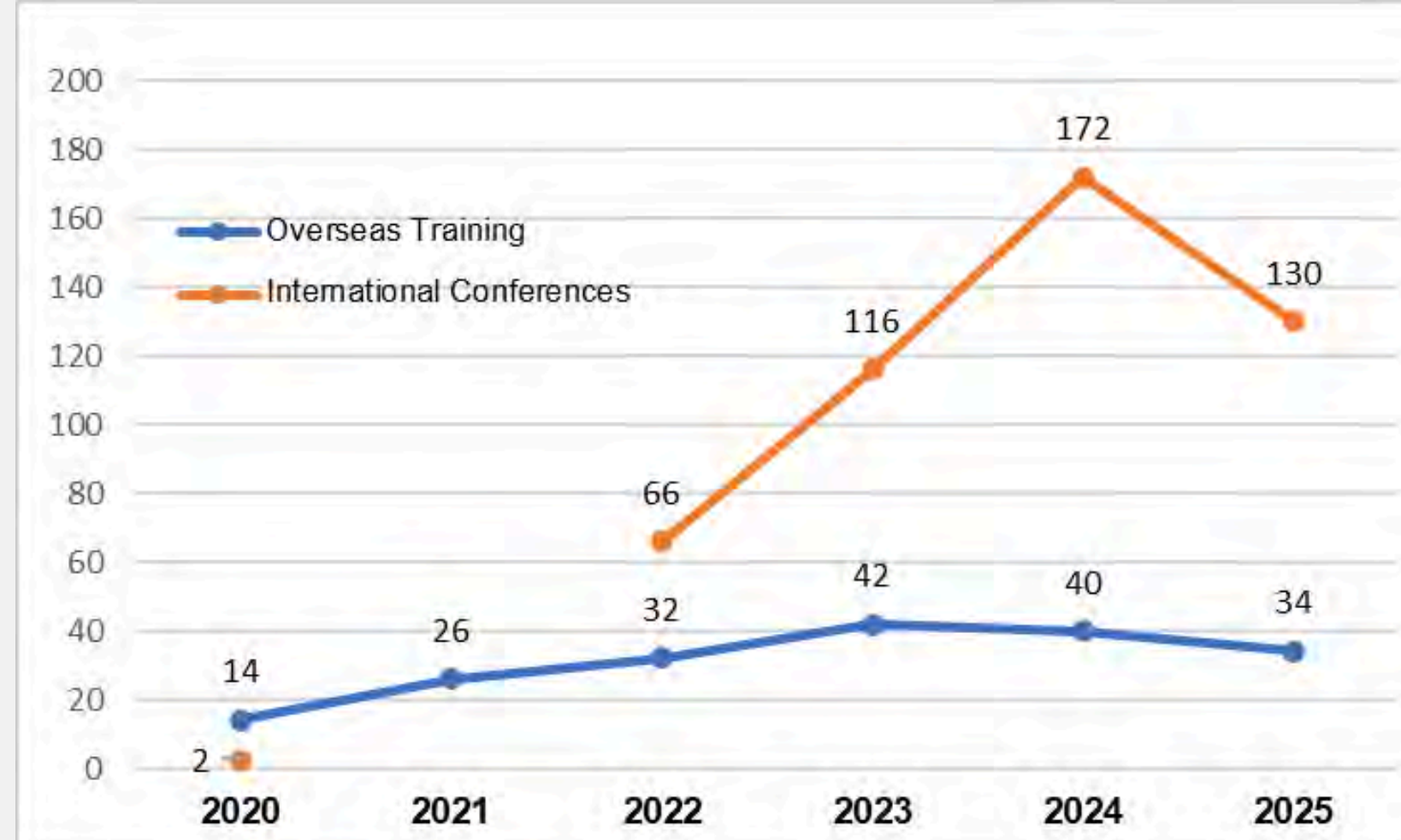
Figure 1: Number of Staff Participating in Overseas Training and International Conferences (2020–2025)