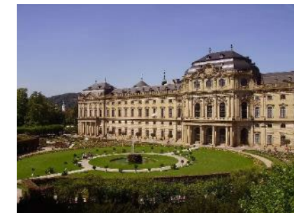
Residence with park