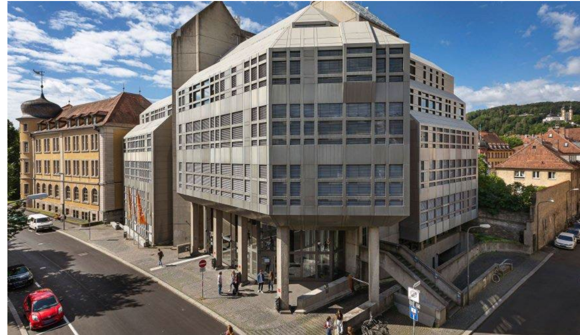
THWS building: Münzstrasse 12 in Würzburg