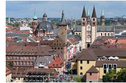
Cathedral & city center