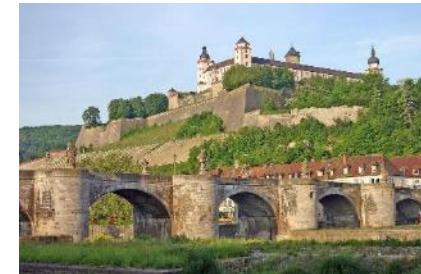
Fortress & vineyards